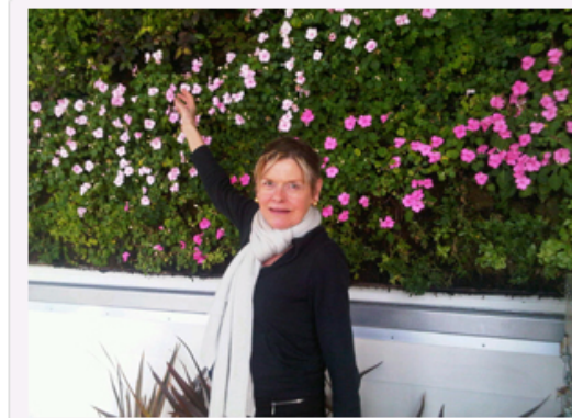
Keeping warm in front of Andaz San Diego's rooftop living wall

More walls, Andaz style. Tucked away on the rooftop (more later, again) is a living wall. It is pea-size compared to the papaya-size of the world's largest living wall, at the Oberoi Gurgaon which I will see when in Delhi next month. But this, here in San Diego, is perfectly tended, quality rather than quantity, gal.