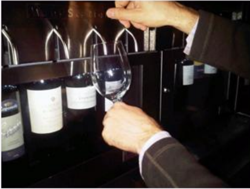
Insert your chip card, and put a glass under the appropriate bottle...

And one more wall. Several places have oenotech machines (think Fairmont Pacific Rim in Vancouver) but this one is mega. Ivy Wine Bar has one long wall of 80 inverted bottles, and credit card slots.