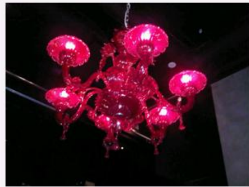
Pink chandelier in a dark wine cellar

The darkness of the wine cellar's wine cabinets and wood furniture was highlighted by a fuchsia dayglo chandelier, similar to the yellow dayglo one Starck has put into the spa at Viceroy on Brickell, Miami – but this one is not Starck.