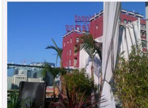
Looking around at breakfast, Andaz rooftop

Of course – everything he does does. Remember how he decorated Wills and Kate's going away car at The Royal Wedding? Wonder if he, too, headed two blocks west for some of the best shopping in California, namely at the Nordstrom in Horton Plaza?