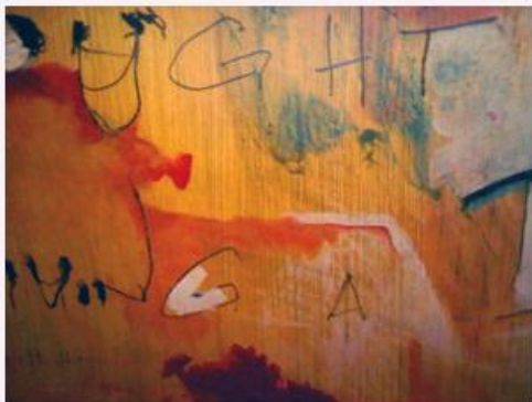
Can't Stand A Day Living Without You - at Andaz San Diego

How about a wall theme? A WHAT theme. A WALL theme. Take Andaz San Diego, a lifestyle luxury hotel. It is full of eye-catching walls.