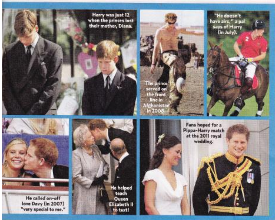
Harry was just 12 when the princes lost their mother, Diana.