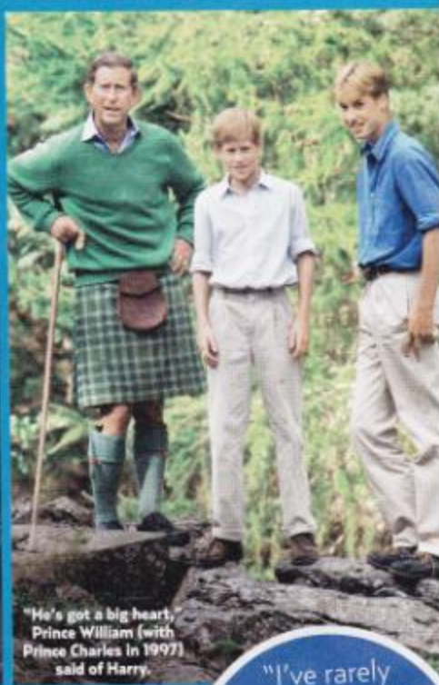
"He's got a big heart," Prince William (with Prince Charles in 1997) said of Harry.

dancing and watching rugby on TV. "He is the modern-day, more fun version of Prince Charming."