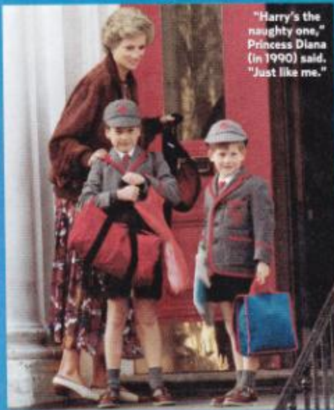
"Harry's the naughty one," Princess Diana (in 1990) said. "Just like me."

From cute tyke to sexiest royal bachelor, Harry grew up in public